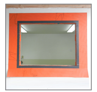
11. Immediately spread the applied material with a putty knife creating a 1" border around the rough opening.