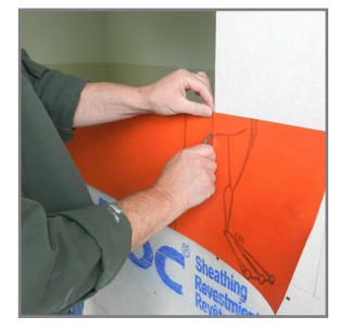
4. Slit material at corners to allow it to fold into the opening.