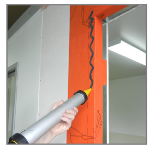
10. Using the sausage gun or DRY joint knife, apply VaproLiqui-Flash in a zigzag pattern on the wall face surrounding the rough opening.