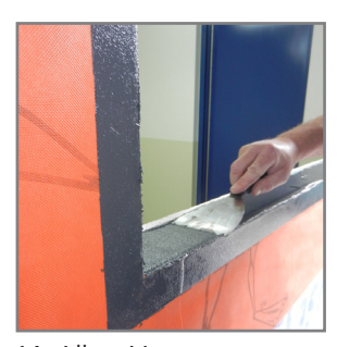
14. Allow Vapro-Liqui-Flash to set up until dry to the touch, then inspect for voids and apply additional Vapro-Liqui-Flash as needed to achieve complete coverage.