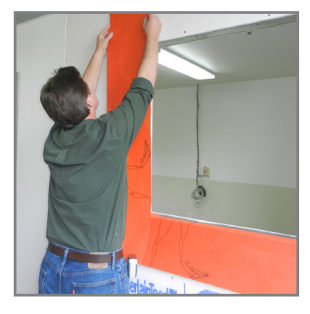
6. Install left & right jamb flashing, adhering the entire flashing to the left and right of the jamb by removing the release paper starting at the top and slowly pulling down, smoothing with your other hand as you remove the release paper.