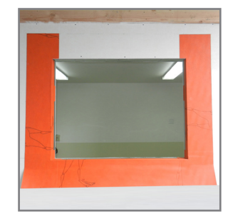
8. Install head flashing only after both left & right jamb pieces are fully adhered.