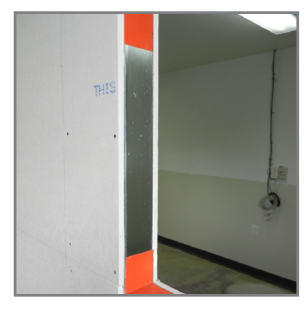
1. Cut and install WrapFlashing SA patches over pre-punched holes in metal studs, if present.