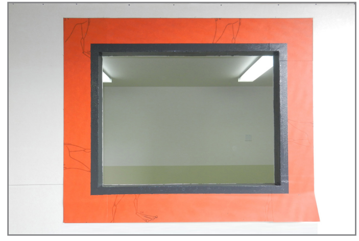
Completed application of VaproLiqui-Flash installed around all surfaces of rough opening.