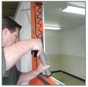
12. Apply additional VaproLiqui-Flash in zigzag pattern on all inner surfaces of the rough opening.