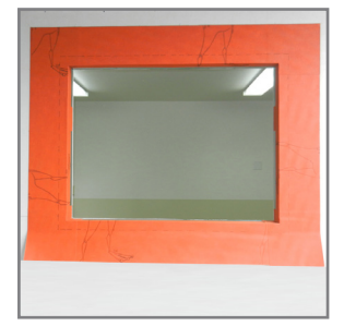
9. Repeat steps 4 and 5 for the head flashing.