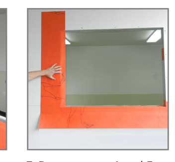
7. Repeat steps 4 and 5 for the left & right jamb flashing.