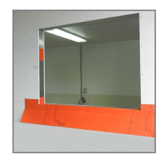
5. Fold flap into opening and adhere to inside surface, being sure to keep the lower 6" of release paper intact.