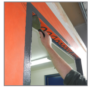
13. Immediately spread until all surfaces are completely covered and substrate below is no longer visible (approximately 12 to 15 wet mils).