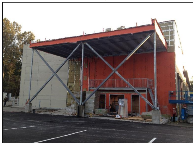
Over 24,500 sq.ft. of WrapShield SA Self Adhered Water Resistant Vapor Permeable Air Barrier Sheet was installed on the Vancouver Operations Center.