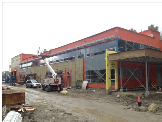
WrapShield SA Self-Adhered is tough, durable and tear resistant during installation.