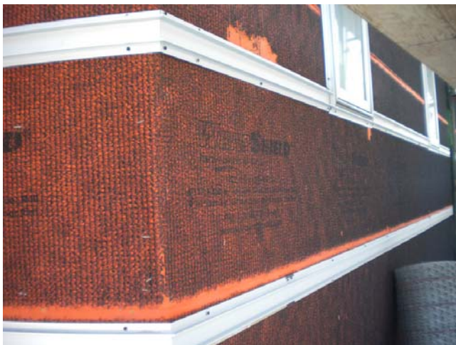
WrapShield HS under stucco.