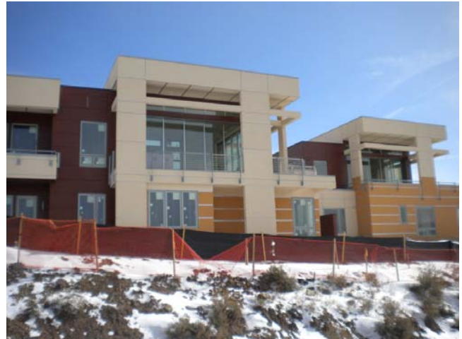
WrapShield under exterior decorative cladding.

WrapShield bonded to HomeSlicker creates WrapShield HS. A unique water resistant membrane creating the necessary airspace in a rain screen wall system.