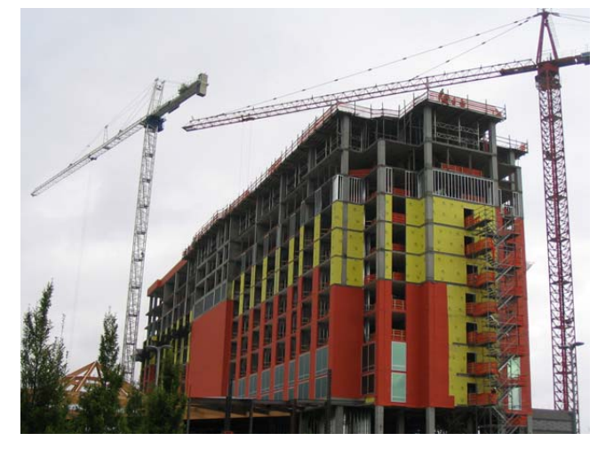
Over 90,000 sq. ft. WrapShield was used on the Tulalip hotel.