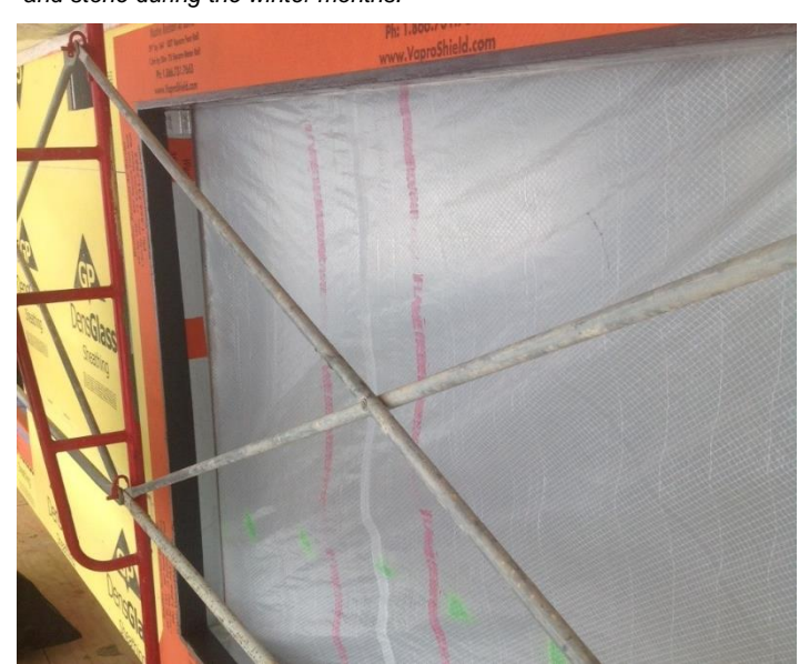
VaproLiquiFlash was used as a liquid applied waterproof flashing material for window and door interfaces.