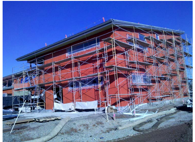
Over 36,000 ft 2 of WrapShield SA was used for this project.