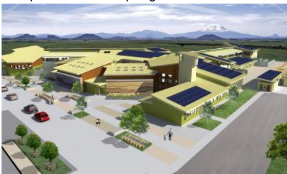
Architectural rendering of Redding School of the Arts.

The project will accommodate approximately 400 students and 60 employees. The 52,000 square feet, two-story building includes classrooms, art rooms, music rooms, library, information center, technology room and piano lab. Estimated completion time is Spring 2011.