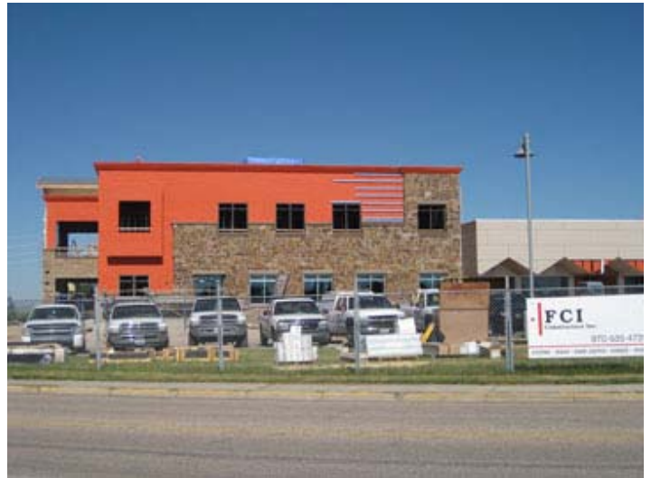
Over 20,000 sq.ft. of WrapShield SA Self Adhered and WallShield were used.

Next the horizontal Z girts were installed creating an anchor for the insulation and to act as a structural component for the Trespa panel system and the rigid exterior insulation. WallShield with black flashing was attached to the Trespa 3 rigid insulation, protecting the insulation and acting as a sacrificial layer to ensure the insulation is protected and has the ability to dry-out. The outer, open joint cladding is Trespa TS 110.