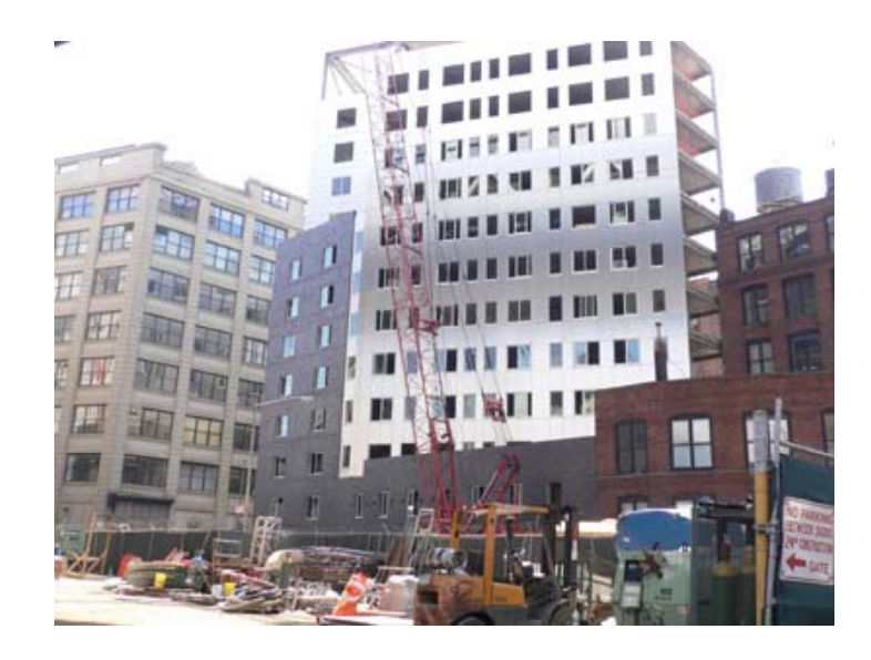
The 133 Water Street condominium project with Black WallShield