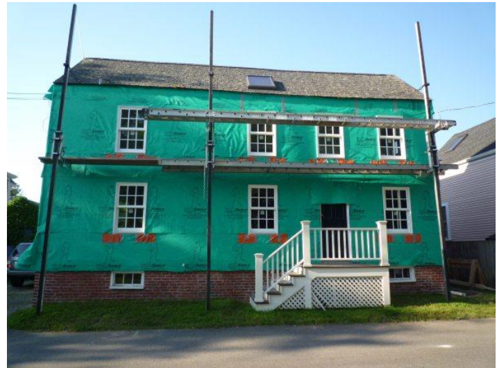
3,200 sq.ft. of WallShield Water Resistive Barrier Sheet was installed on this coastal home in New Hampshire.