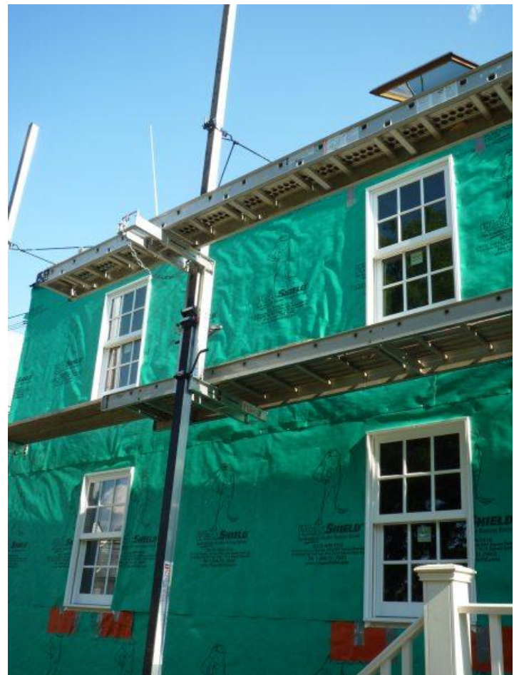
The homeowner is attributing the extended life of the cladding directly to WallShield.