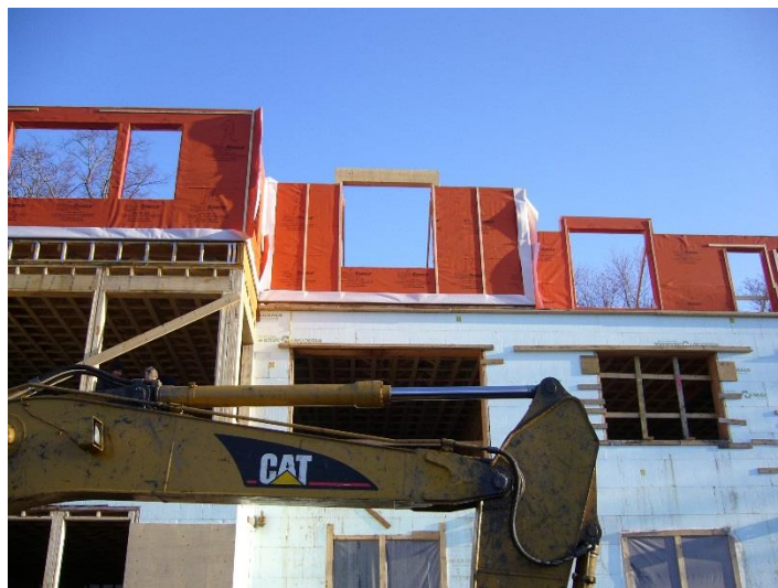
Over 12,000 sq.ft. of WrapShield Water Resistive Vapor Permeable Air Barrier Membrane was installed on the riverfront home.