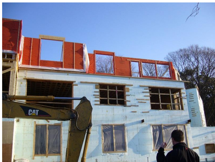
WrapShield offers a tough, durable and tear resistant air barrier.