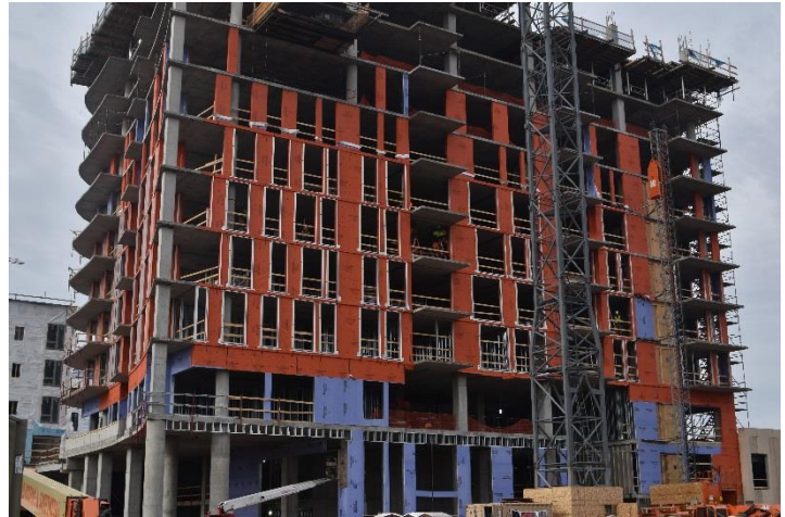
WrapShield SA Self-Adhered WRB/Air Barrier (orange) being installed on NordHaus urban development community in Minneapolis, MN.

WrapShield SA Self-Adhered eco-conscious building set in a high-traffic area. WrapShield SA supports efforts towards achieving LEED certification, was awarded the Declare label, and emits zero VOC's. Entirely self-adhering, it does not require any primer, protecting nearby pedestrians.