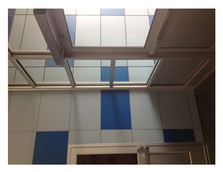
WrapShield SA Self-Adhered was installed under Trespa Meteon TS110 system.