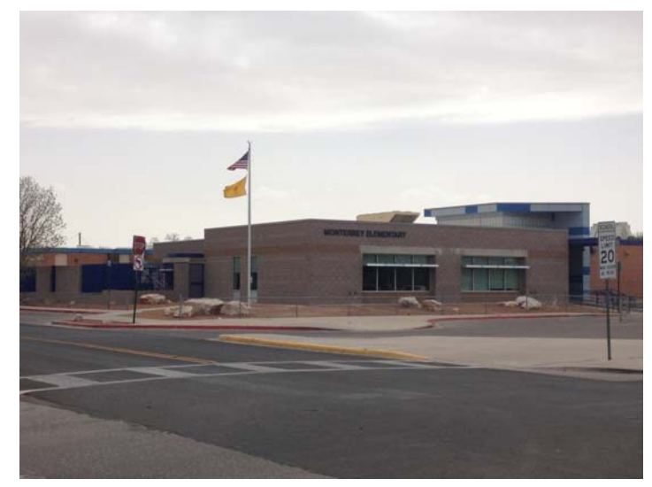
Approximately 1,000 sq.ft. of WrapShield SA Self-Adhered Water Resistive Vapor Permeable Air Barrier Sheet was installed.