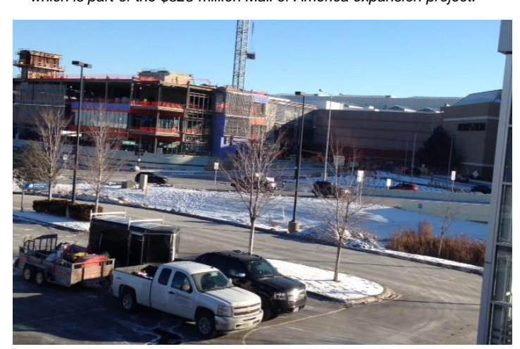
With its durability and all climate friendly installation, WrapShield SA Self-Adhered can withstand the harsh Minnesota winters during construction.