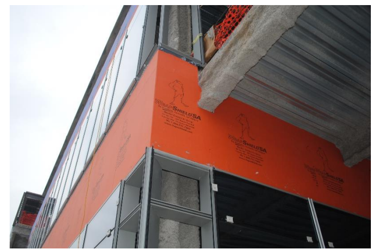
Over 190,000 sq. ft. of WrapShield SA Self-Adhered Water Resistive Vapor Permeable Air Barrier Sheet was installed on the JW Marriott, which is part of the $325 million Mall of America expansion project.