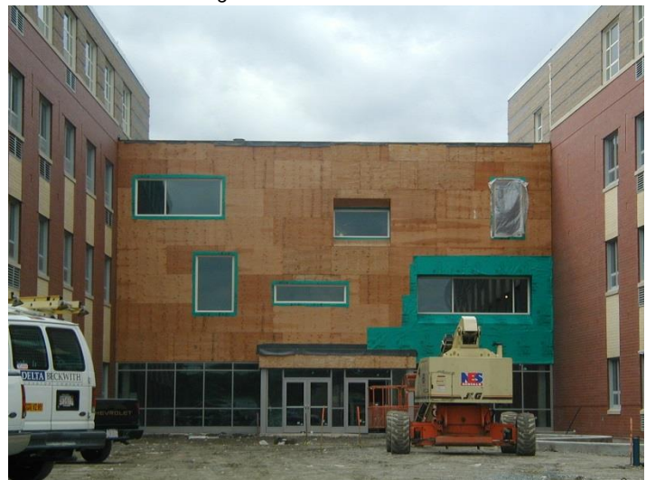
WallShield was installed behind the Rheinzink exterior cladding.