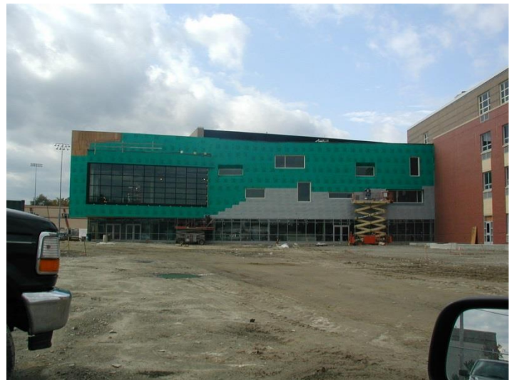
Over 32,000 sq.ft. of WallShield Water Resistive Barrier Sheet was installed on the new high school.