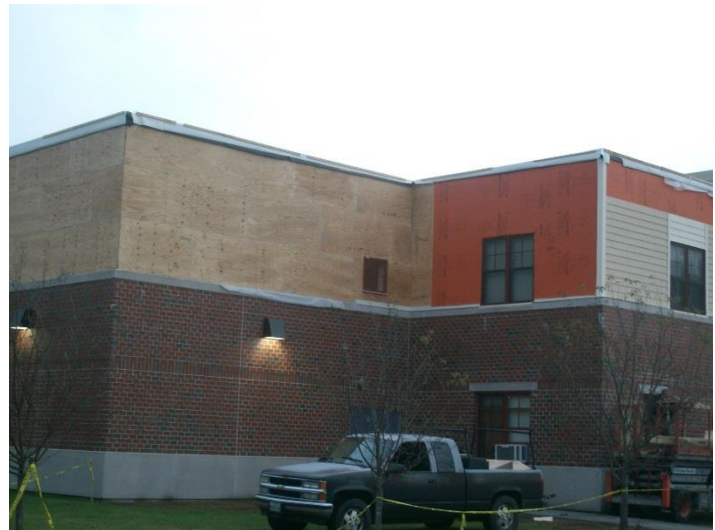
By installing WrapShield SA Self Adhered, the architect was assured that the wall assembly would breathe properly.