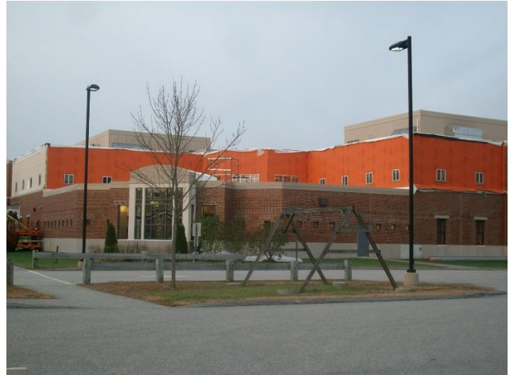
9,000 sq.ft. of WrapShield SA Self-Adhered Water Resistive Vapor Permeable Air Barrier Sheet was installed at Kennebunk Middle School.