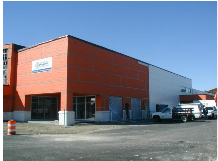
WrapShield offers a tough, durable and tear resistant air barrier.

Clear integrated adhesive tape on both the upper and lower courses