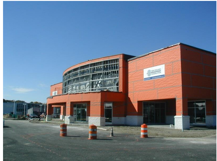
Over 18,000 sq.ft. of WrapShield Water Resistive Vapor Permeable Air Barrier Membrane was installed on the Inskip BMW dealership.