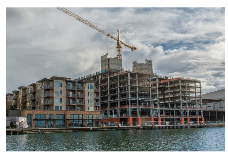
WrapShield SA Self-Adhered was chosen for its ability to be applied in the windy, wet weather conditions of Washington.