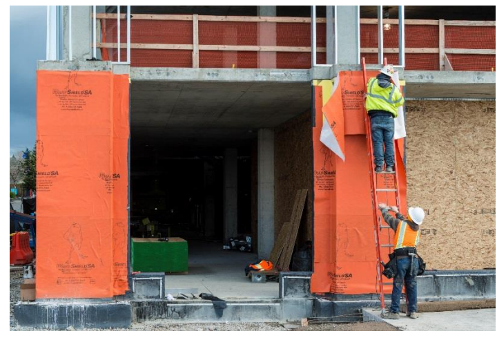
Over 100,000 sq.ft. of WrapShield SA Self-Adhered is being installed on the Hyatt Regency Hotel in Seattle, WA.

The 347-room luxury hotel is located on the shores of Lake Washington and will be the first luxury hotel near Seattle's Sea-Tac International Airport. Construction began in October of 2014 and is expected to open in June of 2017.