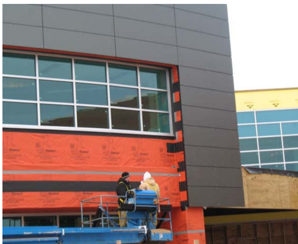
Installation of VaproFlashing Black