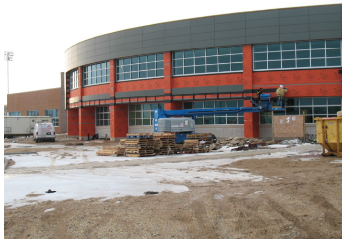
Note installation of VaproFlashing Black