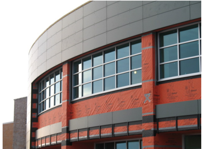
WrapShield (orange) installed under Trespa cladding.

Approximately 8,000 sq. ft. of VaproShield WrapShield was selected due to its ability as a breathable air barrier, in conjunction with required features behind a Trespa Rainscreen Cladding System, including: self-cinching, UV stability and black flashing behind open joint reveals.