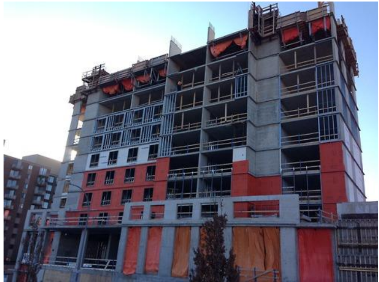
Over 100,000 sq.ft. of WrapShield SA Self-Adhered Water Resistant Vapor Permeable Air Barrier Sheet was installed.