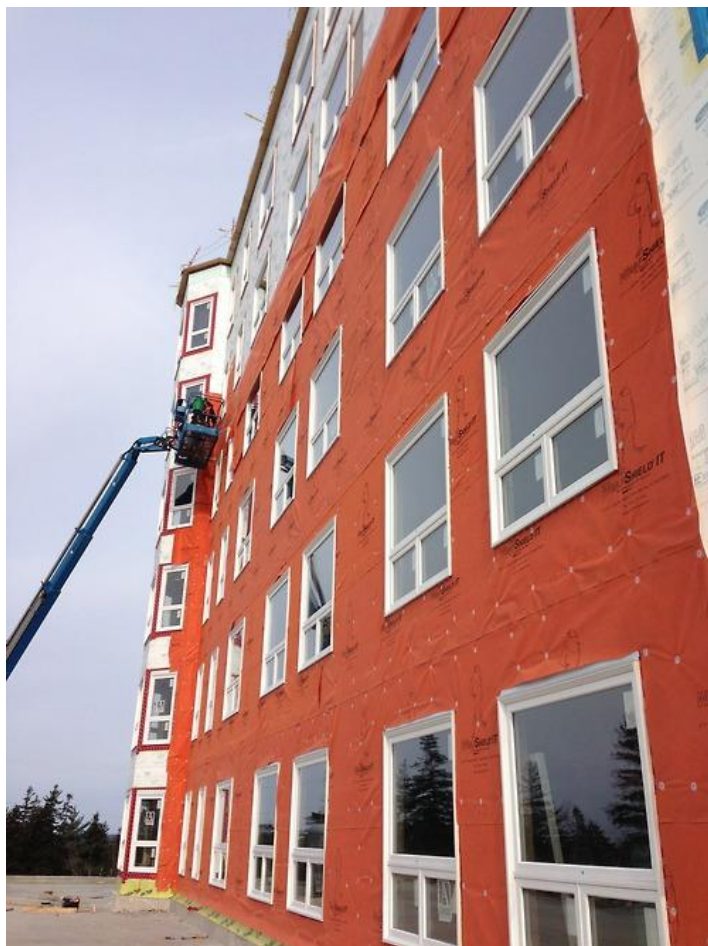
Over 75,000 sq.ft. of WrapShield Water Resistive Vapor Permeable Air Barrier Membrane was installed.