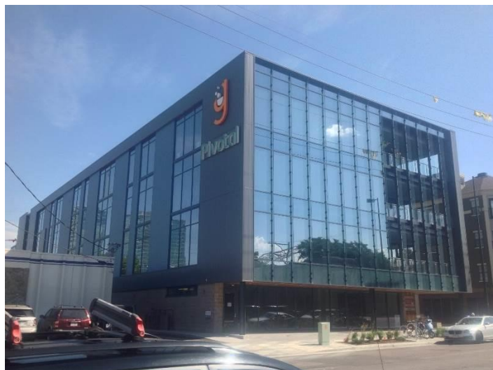
Over 20,000 sq. ft. of WrapShield was installed on the new Galvanized 2.0 building in Denver, Colorado