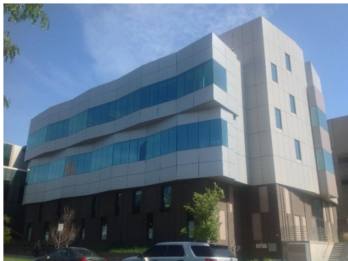
WrapShield SA Self-Adhered is ABAA approved, contains zero VOC's and offers a standard 20 year material warranty.