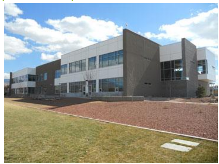
Over 10,000 sq.ft of VaproShield Wrapshield was used on the high school.