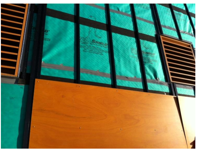
WallShield and WrapShield Black offer UV protection and temperature resistance during installation.