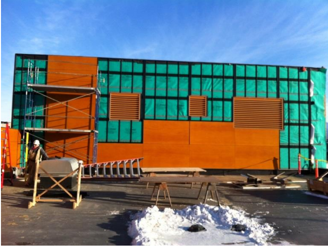
Over 20,000 sq. ft. of WallShield Water Resistive Barrier Sheet was installed on the Covenant House in Alaska.