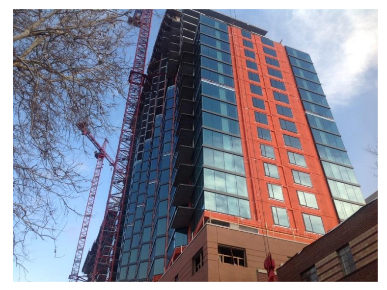
WrapShield SA Self-Adhered WRB/Air Barrier (orange) is being installed on The Country Club Towers in Denver, Colorado.

Once completed, the 31-story building will feature 558 luxury units with panoramic views. Residences can expect to enjoy many other chic amenities including: granite countertops, a 26,000 sq. ft. deck with lap pool, and an all-inclusive fitness center.