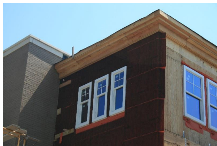
WrapShield HS offers a tough, durable and tear resistant air barrier.