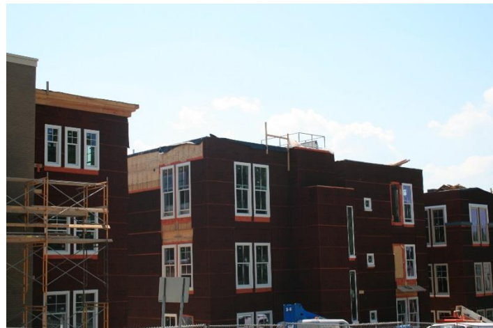
WrapShield HS is a mechanically attached, water-resistive vapor permeable air barrier sheet with an attached drainage matrix.