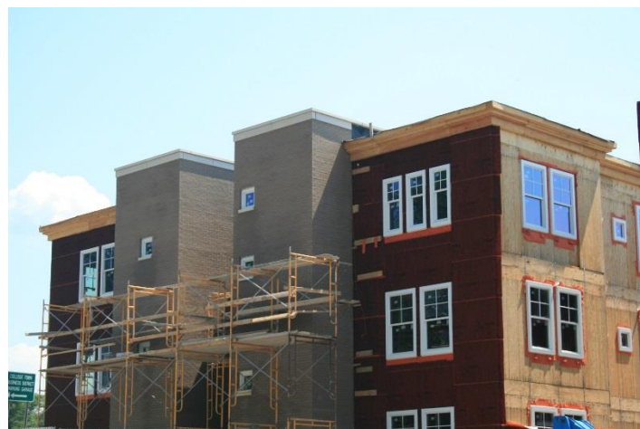
Over 250,000 sq.ft. of WrapShield HS Water Resistive Vapor Permeable Air Barrier Sheet with Drainage Matrix was installed on the Collegetown student housing buildings in Ithaca, NY.