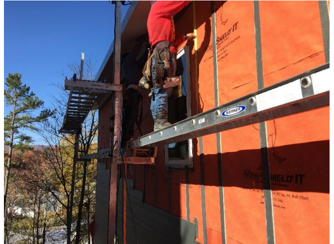
WrapShield IT seals horizontal seams and easily creates the shingled effect for optimum air and water tight horizontal joinery

In 2015, the NextGen Home was recognized as a LEED certified Net Zero 4-home Development. WrapShield IT aligns perfectly with the criteria that was set, as it is 100% recyclable, has zero VOC's and requires no primer for application. Built with WrapShield IT, the Next Gen Home will remain durable for decades to come; truly earning its namesake as a "Next Generation" home.