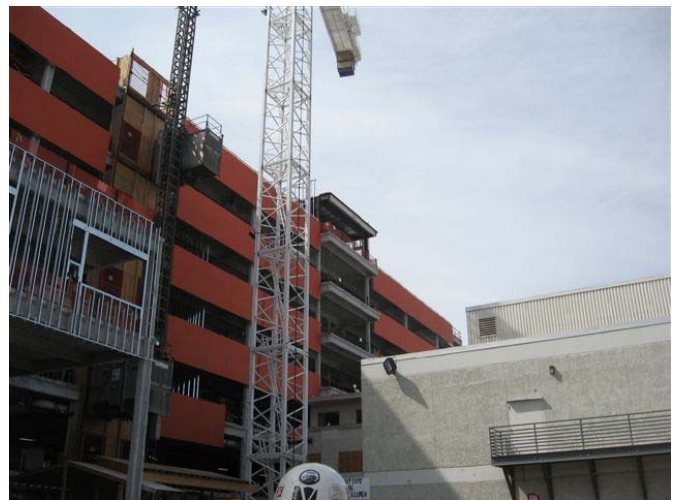
The project is expected to be completed in May 2011.