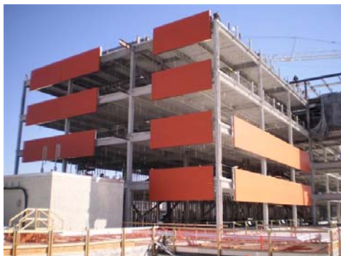
The panels were pre-wrapped, protecting them during shipping.

The 190,000-square-foot addition includes one story underground and four above, and will nearly double the size of the region's largest trauma facility. Central Washington Hospital broke ground on August 25, 2009, and plans to complete the tower project in May 2011.