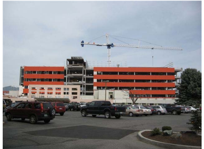
The Central Washington Hospital undergoes a $150M expansion including a five story patient tower (one floor underground).