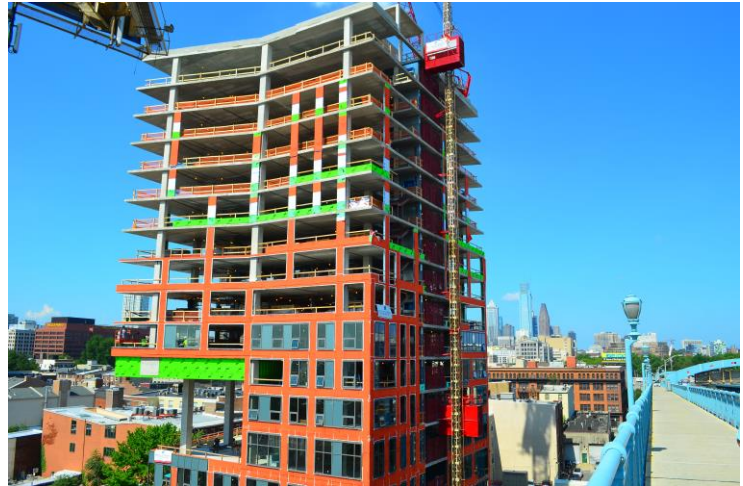
WrapShield SA Self-Adhered (orange) was installed on the new Bridge apartment building in Old City Philadelphia, PA.

As Philadelphia's first LEED Gold building, Bridge provides a sustainable take on luxury. The 146 apartments afford amazing city view, rooftop green space and other high-end amenities. WrapShield SA contributed to LEED points in the Energy & Atmosphere and Indoor Environmental categories.