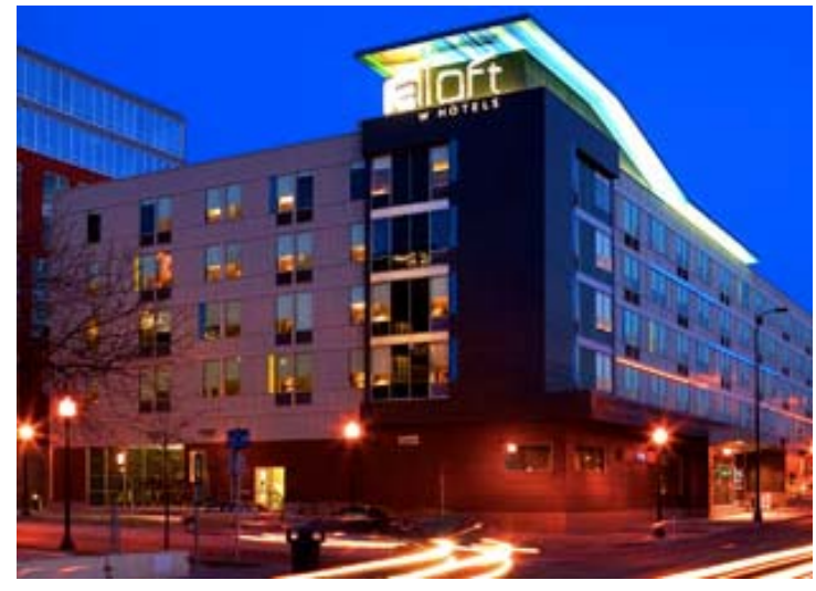
Minnesota's first Aloft hotel located in Minneapolis. .