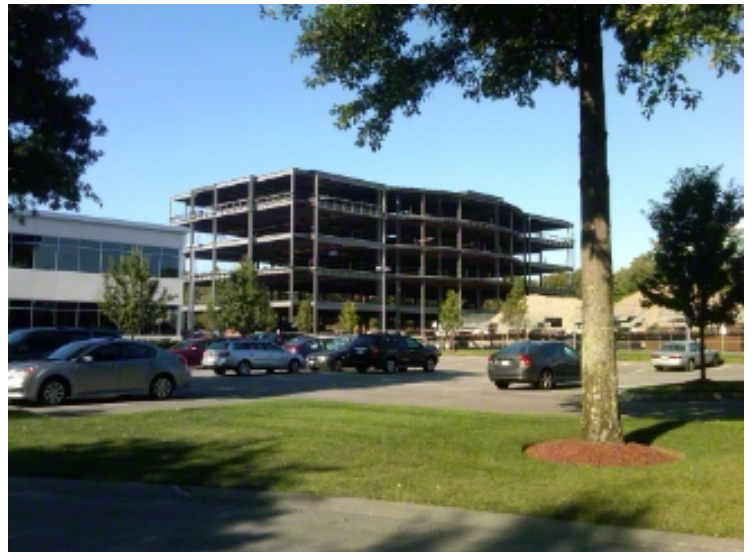
This five-story building is part of a newly developed office park, located just 15 minutes outside of Boston.