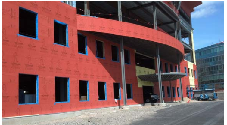
WrapShield SA Self-Adhered offers six months UV and climate exposure.