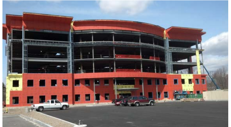
WrapShield SA Self-Adhered Water Resistive Vapor Permeable Air Barrier Sheet was installed on this new construction, commercial building.