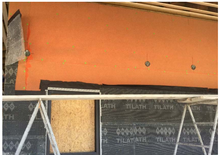
WrapShield RS Rain Screen (orange) was applied to the plywood substrate and the paperback lath paper installed over the 3mm drainage plane. With a minimal 3mm drainage plane, no design changes were required to the stucco façade.