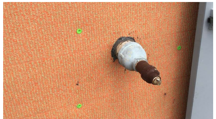
Penetration flashed with VaproLiqui-Flash (gray).