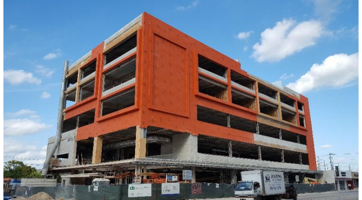
WrapShield SA Self-Adhered WRB/Air Barrier (orange) being installed on Gables Auto Vault in Miami, Florida.

Gables Auto Vault offers luxury car storage and is the first of its kind in southern Florida. Featuring 14 car “condos,” the vault offers climate and humidity-control, hurricane resistant construction and many owner amenities.