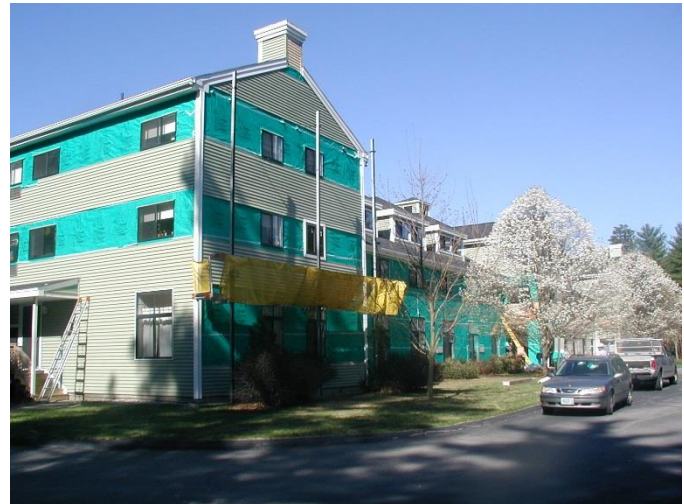
Over 20,000 sq. ft. of WallShield Water Resistive Barrier Sheet was installed on the Atwood Commons Assisted Living Center.