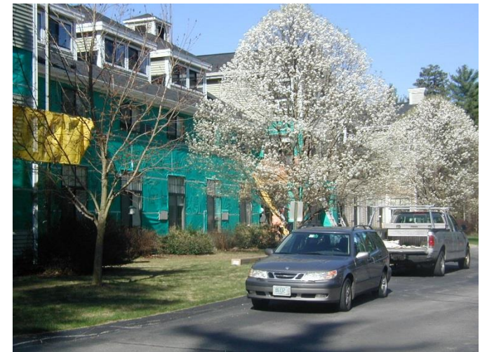
WallShield offers 9 months UV protection and climate exposure during installation.