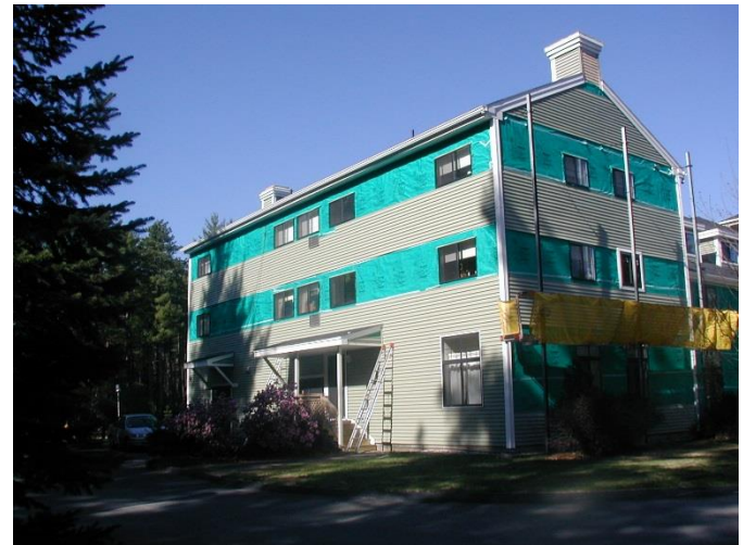
The envelope reconstruction project took place while the building was occupied.