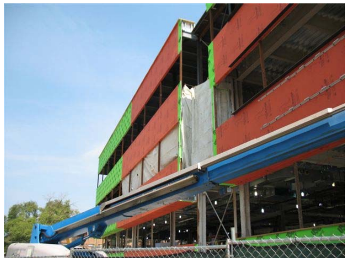
WrapShield SA Self-Adhered protects the North Park University Science Building's vulnerable building envelope from moisture, mold, mildew and corrosion.