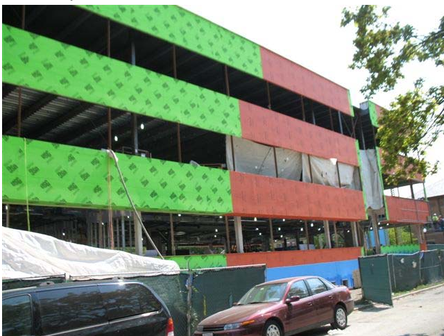
WrapShield SA Self-Adhered combines the best properties of a vapor permeable membrane and air barrier in one innovative, affordable self-adhering product.

A new construction project, the North Park University Science Building will house classrooms, science labs, academic and professorial offices as well as several student services offices. WrapShield SA Self-Adhered vapor permeable air barrier technology will protect North Park University's student body and building investment by allowing moisture vapor to escape the building envelope.