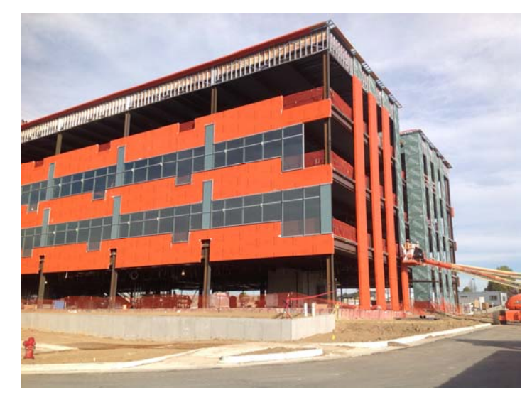
Approximately 20,000 sq.ft. of WrapShield SA Self-Adhered Water Resistive Vapor Permeable Air Barrier Sheet was installed.