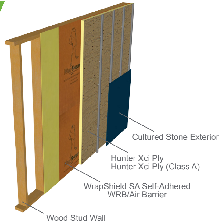
Comprehensive details available at VaproShield.com . Illustration for explanatory purposes only.

Per Chapter 26 of the International Building Code, the wall assembly shall be tested in accordance with and comply with the acceptance criteria of NFPA 285. The listed assemblies in this document have met that criteria according to Hunter Panels. Visit hunterpanels.com for verification.