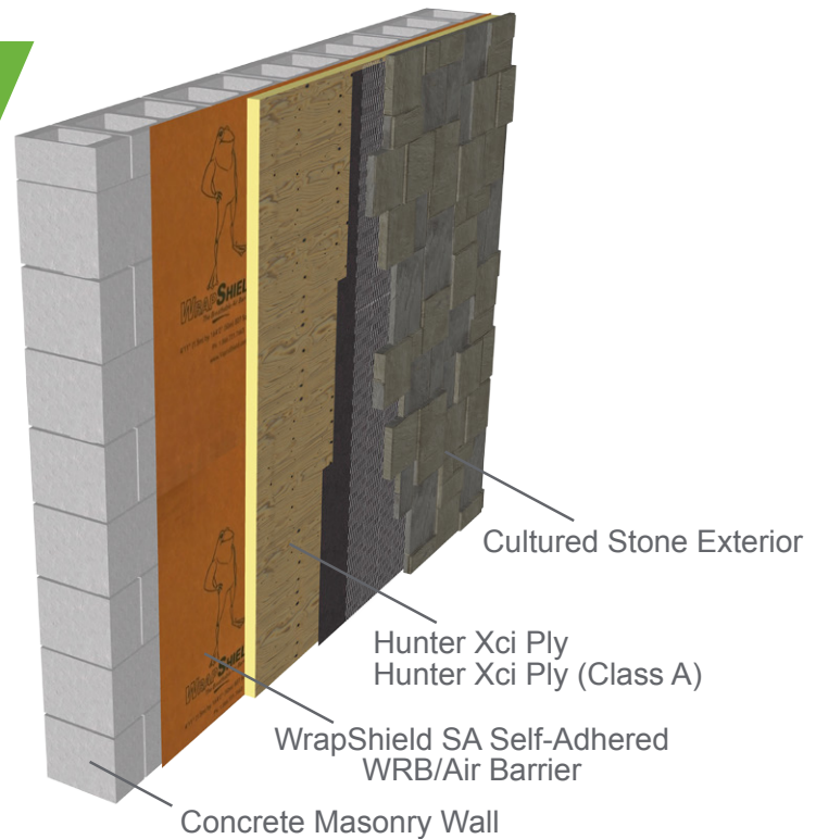
Comprehensive details available at VaproShield.com . Illustration for explanatory purposes only.

Per Chapter 26 of the International Building Code, the wall assembly shall be tested in accordance with and comply with the acceptance criteria of NFPA 285. The listed assemblies in this document have met that criteria according to Hunter Panels. Visit hunterpanels.com for verification.