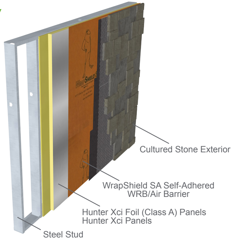
Comprehensive details available at VaproShield.com . Illustration for explanatory purposes only.

Per Chapter 26 of the International Building Code, the wall assembly shall be tested in accordance with and comply with the acceptance criteria of NFPA 285. The listed assemblies in this document have met that criteria according to Hunter Panels. Visit hunterpanels.com for verification.