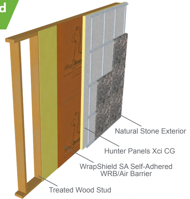
Comprehensive details available at VaproShield.com . Illustration for explanatory purposes only.

Per Chapter 26 of the International Building Code, the wall assembly shall be tested in accordance with and comply with the acceptance criteria of NFPA 285. The listed assemblies in this document have met that criteria according to Hunter Panels. Visit hunterpanels.com for verification.