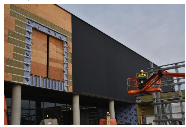
RevealShield SA Self-Adhered eliminates the need for time intensive substrate and rough opening preparation—saving labor costs and time.