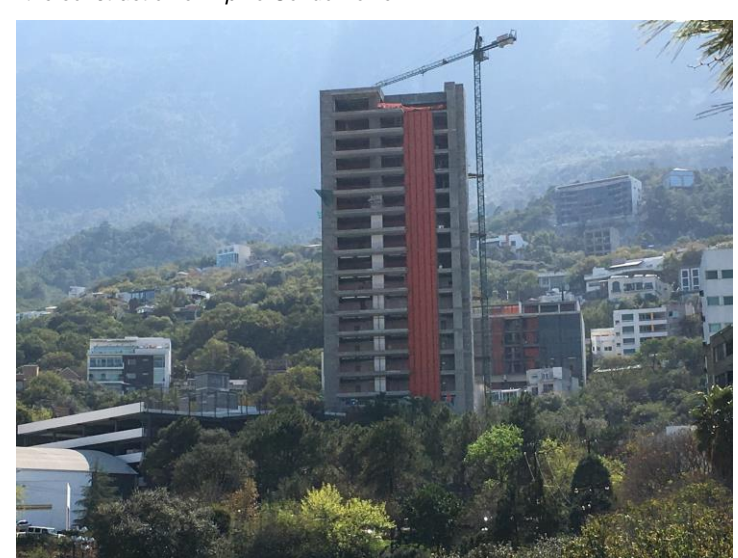
VOC-free WrapShield SA will drastically reduce the incidence of moisture related damage by drying out the building's cementitious substrate, while protecting the surrounding residents and forest by eliminating the need for toxic primers.