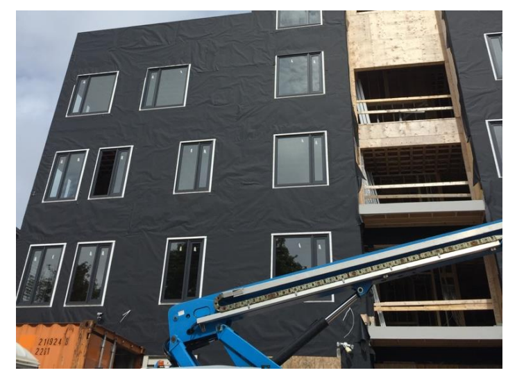
Approximately 35,000 sq. ft. of RevealShield UV Stable Water Resistive Vapor Permeable Air Barrier Membrane was installed on the new Harris East Condos.

The harsh weather of Halifax was no match for the durable and robust RevealShield IT Integrated Tape. The horizontal integrated tape seals in all weather conditions and easily creates the necessary shingle effect eliminating reverse lap conditions.