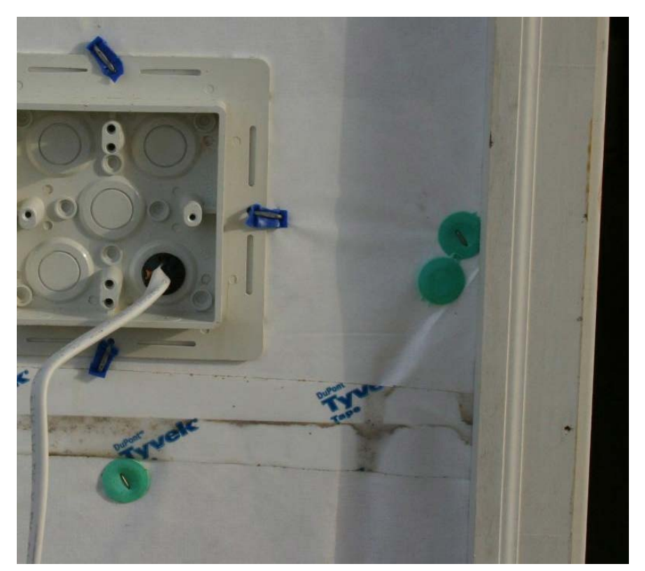
In the photo above the debris from the water intrusion can be seen at the wrinkle in the wrap. Note that the wrap is wrapped into the door frame so water can migrate horizontally past the door frame and into the interior.