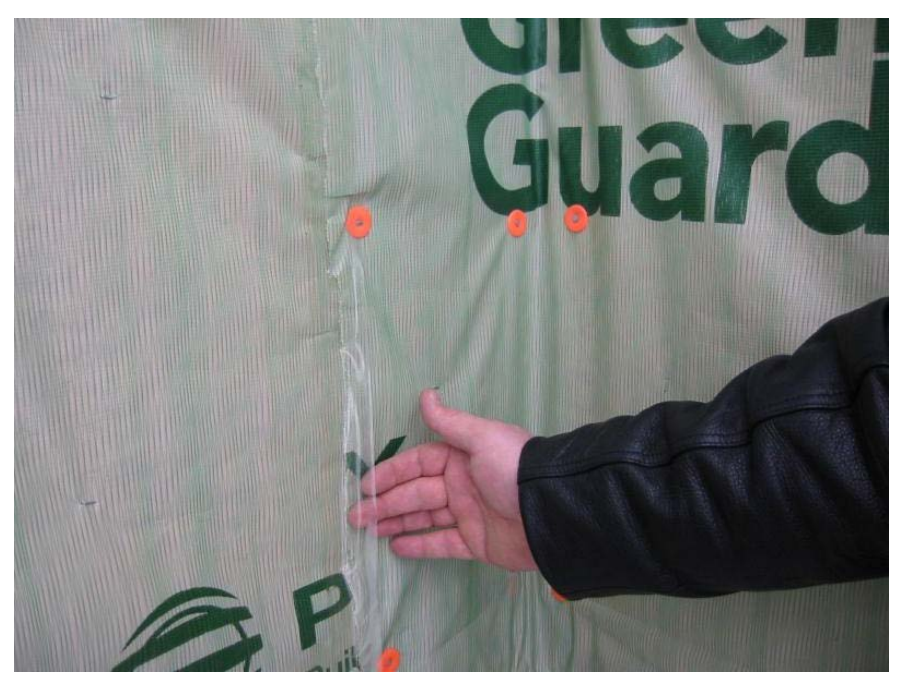
In the photo above you can see that the seam tape did not bond to the wrap.

applied. Other times the surface is damp preventing the tape from adhering properly. Oftentimes cap fasteners installed at the tape edge prevent a complete seal. Wrinkles in the wrap can leave voids at the tape contact surface. All of these conditions can allow water to migrate behind the tape, follow the horizontal seam to the nearest vertical seam, and ultimately into the structure.