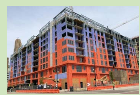
Banks Phase II | Cincinnati, OH