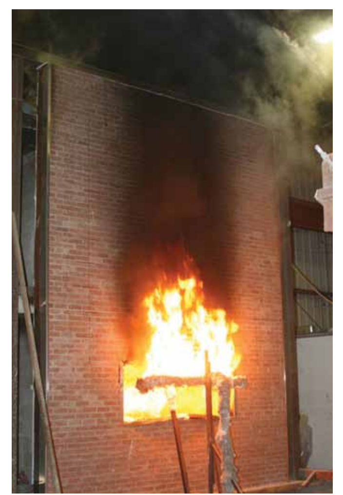
Figure 2. An NFPA 285 test in progress.

Several important points concerning the applicability and use of test results must be emphasized: