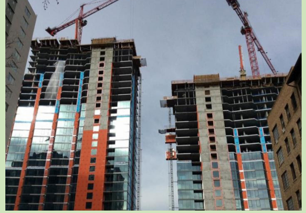
Country Club Towers, a 31-story building containing 558 luxury units with panoramic views