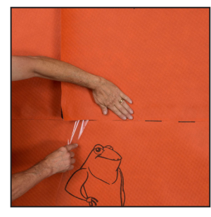
10. Use the opposite hand to smooth the two layers together as the release film is removed.