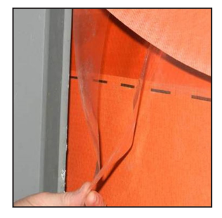
9. Line up both release films together so they can be pulled down the wall with one hand.