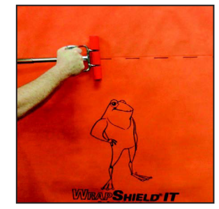
12. Immediately roll the integrated tape horizontal seams with floor roller to ensure full contact.