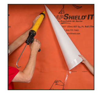
4. Overlap vertical seams by 12" minimum. Apply VaproBond Adhesive Sealant bead just below Integrated Tape line at the vertical seam joint.