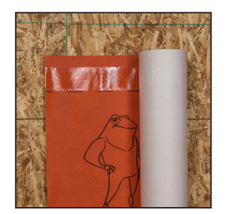
1. Begin installation at the base of the wall, progressing in a shingle fashion upwards. Snap a level chalk line for guidance.