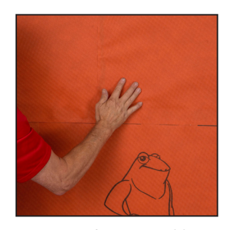
11. Smooth out wrinkles with hand pressure.