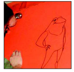
7. Cut and pull back release film at bottom of membrane sealant joint where horizontal joint intersects with vertical joint. Go over sealant joint with a weighted roller.