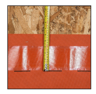
3. Line up the bottom of the upper course of material with the dotted line, creating a 6" overlap.