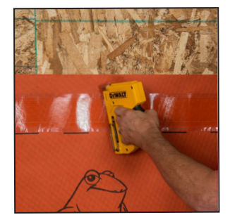
2. Install with SS staples in the top 2" above the Integrated Tape. Avoid stapling in the tape area.