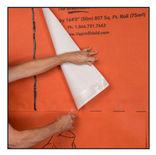
6. Lay overlapping layer of WrapShield IT onto vertical sealant joint and smooth with hand pressure.