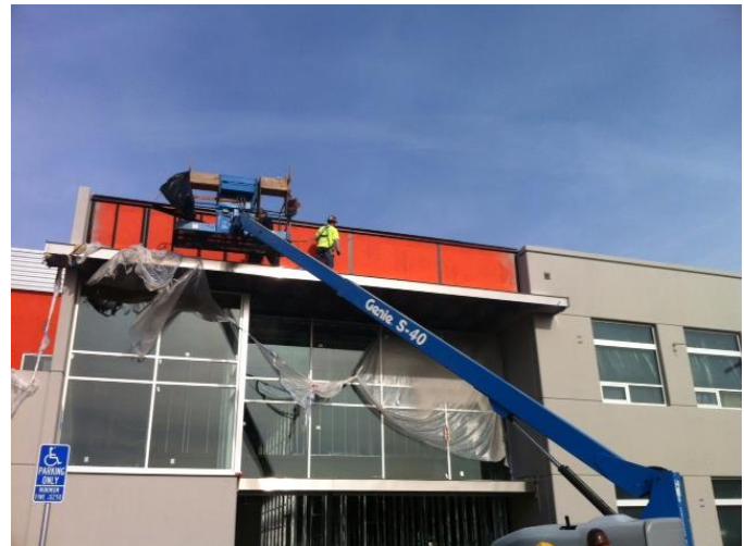
WrapShield SA is tough, durable and tear resistant during installation.