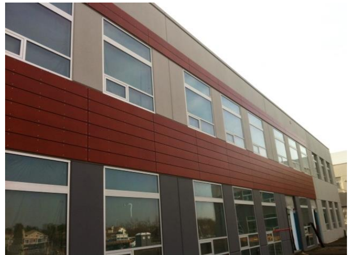
WrapShield SA was installed behind Parklex open joint system.