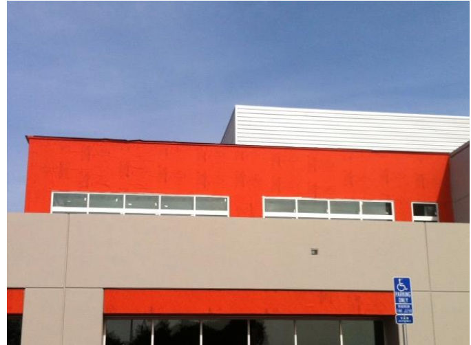
Almost 5,000 sq.ft. of WrapShield SA Self Adhered Water Resistive Vapor Permeable Air Barrier Sheet.