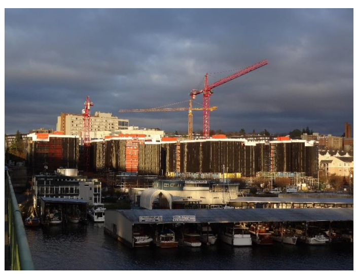
WrapShield is phase construction friendly, installs in all weather conditions and does not require special equipment.