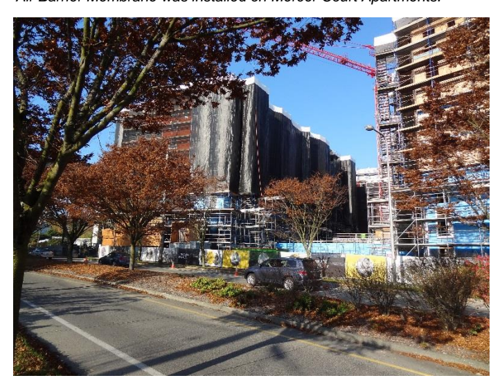
WrapShield offers a tough, durable and tear resistant air barrier.