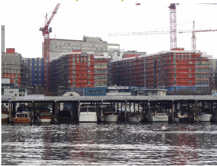
Over 400,000 sq.ft. of WrapShield Water Resistive Vapor Permeable Air Barrier Membrane was installed on Mercer Court Apartments.